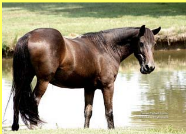
Rescued Horse, Popeye —One of our BEST TEACHERS!